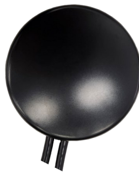
Magnetic / Adhesive Mount