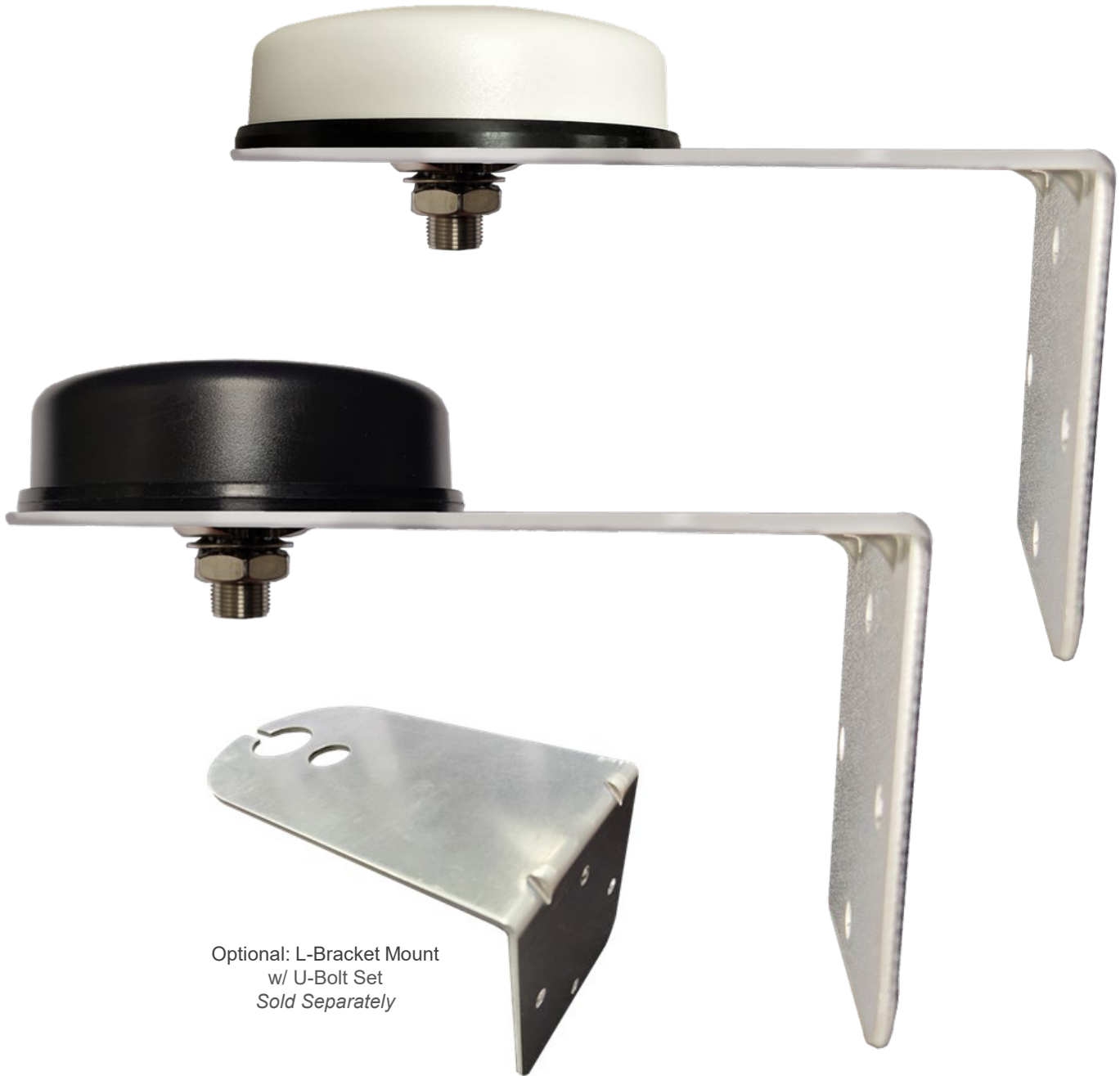
Optional: L-Bracket Mount w/ U-Bolt Set Sold Separately

M460F Low-Profile Series Bolt Mount Antenna w/ Optional L-Bracket Mount Sold Separately