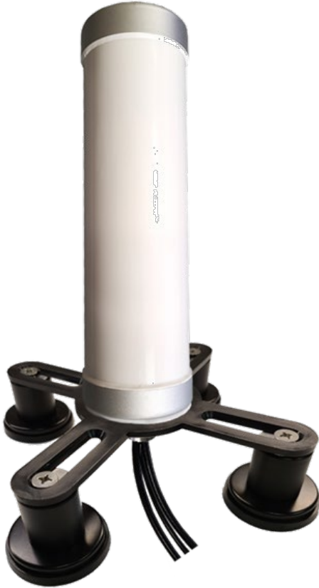
Optional: Rugged M-Lander Adjustable Magnetic Mount Adapter Sold Separately