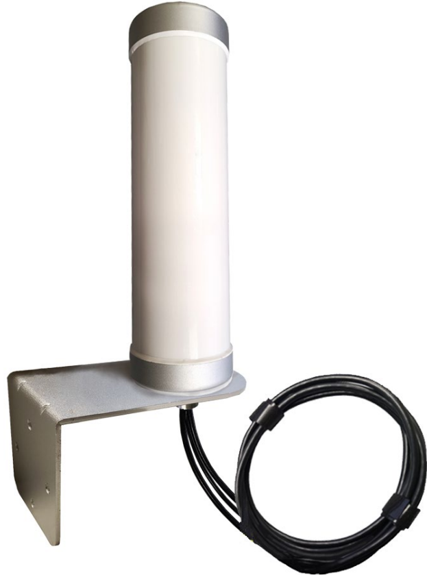
Optional: L-Bracket Mount Adapter w/U-Bolt Set Sold Separately