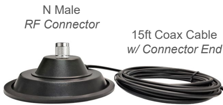
N Male RF Connector