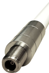
N Female Base RF Connector