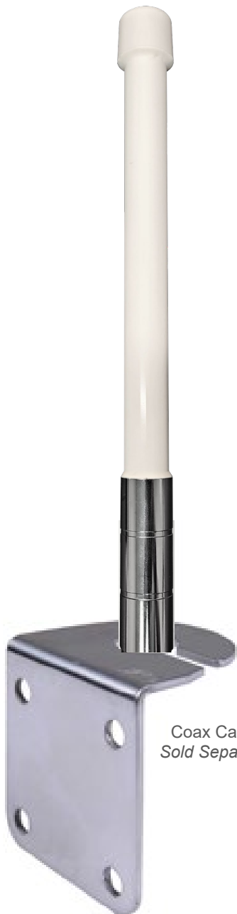
M1000-M15 Magnetic Mount